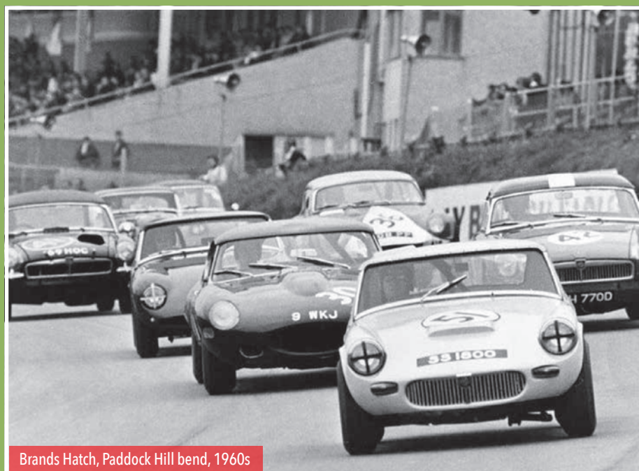
Brands Hatch, Paddock Hill bend, 1960s

throughout the day, showcasing rare and historically significant cars. For many spectators, this will be a chance to see cars in motion that are normally only admired in static displays.